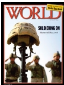
Soldiering on May. 27, 2006