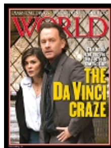
The Da Vinci craze May. 20, 2006