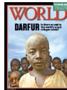
No way out May. 13, 2006