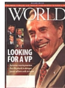
Dole: Looking for a VP May. 25, 1996