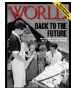
Germ warfare and national security Jun. 2, 2001