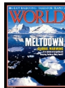
Meltdown Apr. 22, 2006