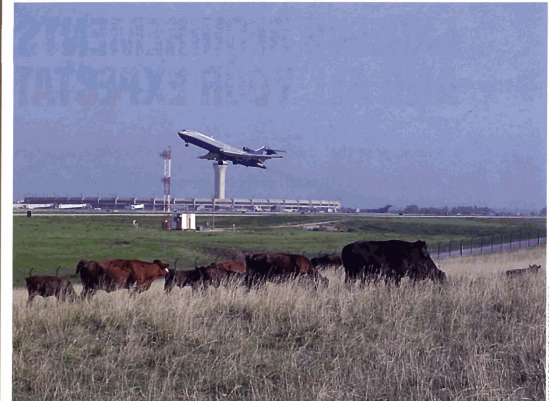
KANSAS CITY AVIATION DEPARTMENT

Increased reporting and better technology are giving industry unparalleled intelligence on bird strike trends.