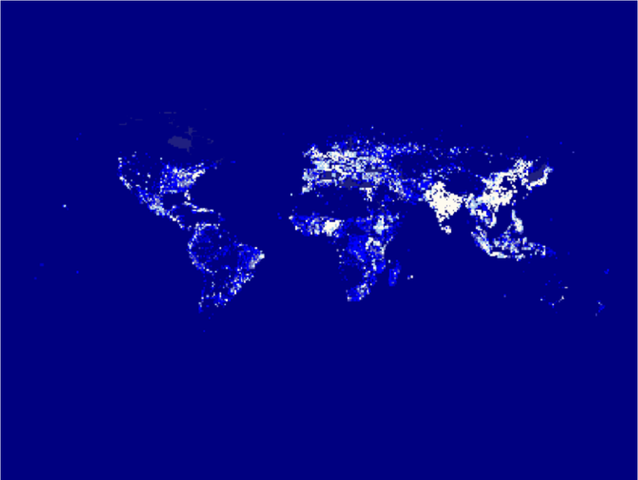
Figure 2. Upward light flux if all people lived like—that is, emitted light—like Americans. Although crowded places emit somewhat less per person than uncrowded places, flux increases fairly regularly with population despite differences in wealth.

to 0 in some areas of Alaska. 3 Using population with 1-degree resolution for the year 1990 (Li, 1997), Figure 2 shows how bright the night around the world would become if everyone in the world emitted 2.0 \times 10^{-24} watts/cm 2 /sr, like the median American in 1996. 4 Subtracting the light in Figure 1 from the light in Figure 2 reveals a geography of potential development (Figure 3 – see following page). Because the light flux from a region is proportional to its electricity consumption, the geography of the increased light charted in Figure 3 suggests the geography of latent electricity demand. Entrepreneurs and environmentalists alike must take notice.